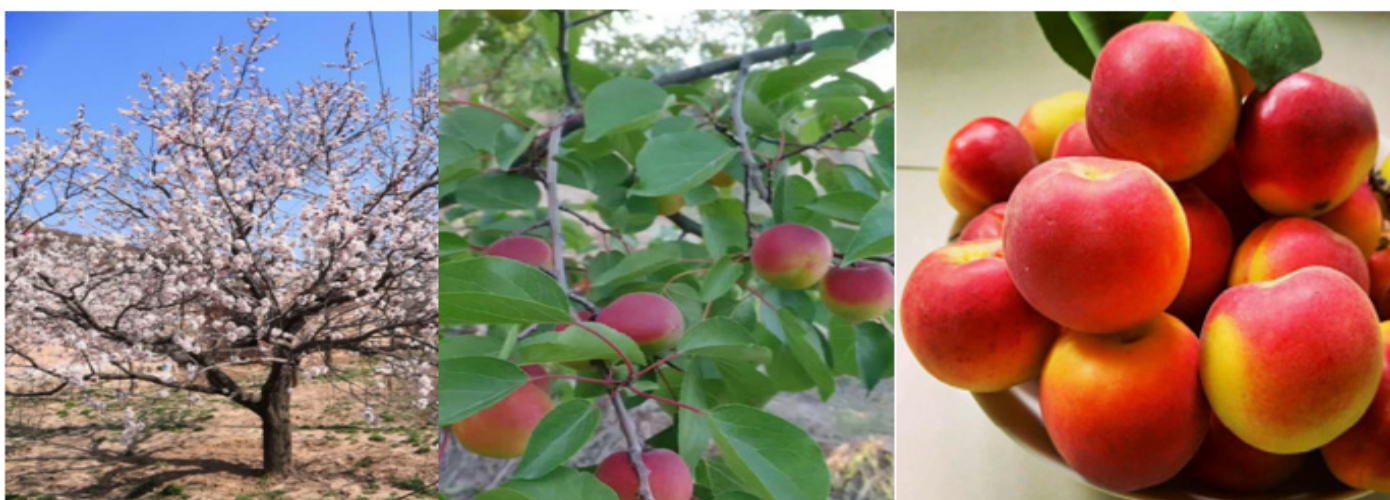
Photo 1 Flowers and fruits of red plum apricot in the semiarid loess hilly region (Guyuan, China)

The two vertical distribution curve of soil water before and after the infiltration process can be used to determine infiltration depth and soil water supply for one rain event or a period. The infiltration depth for one rain event or a given time was equal to the distance from the surface to the crossover point between the two soil water distribution curves with soil depth before a rain event and after the rain event, and the MID could be estimated by a series of two-curve methods, a set of two-curve methods.